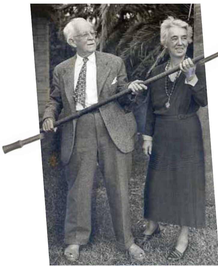
Dr. David and Marian Fairchild, standing in front of the Garden House, admire the ingenuity of turning a palm trunk into a weapon.

Agassiz died in 1873, but his son in many ways continued his work. Alexander Agassiz, a student of engineering and chemistry, later gained expertise in ichthyology. He also made a fortune in copper mining, but not without teaching and curating in the museum his father created. During the Thayer Expedition, Alexander remained back at the Harvard Museum of Comparative Zoology to receive his father's shipments from the Amazon; he is key to uncovering the path the blowgun took to get to the Garden.